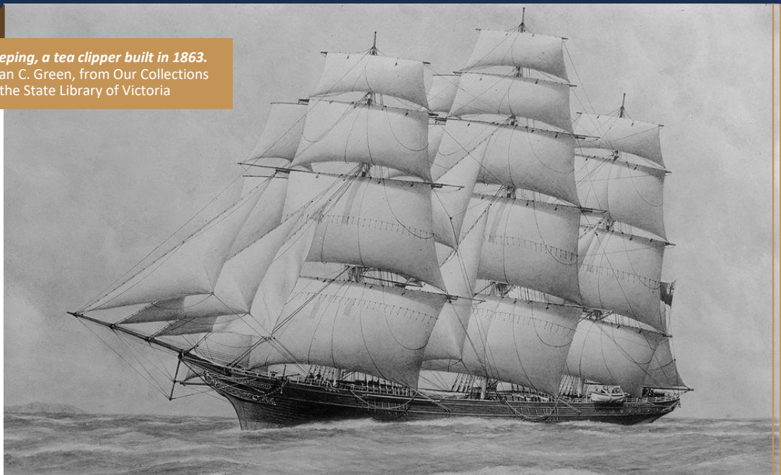
Taeeping, a tea clipper built in 1863.

They found that when oil was rubbed into the discarded scraps of sails, they could create a material that was both durable and waterproof and would stand up to the roughest of weather.